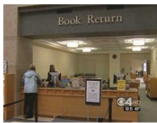
1 of 1 Click to enlarge

DENVER (CBS4) — The Denver Public Library is dealing with a problem usually found in homes or hotels. They say a customer returned books infested with bedbugs.